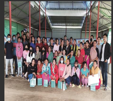
For the first time in Manipur, Ingelei Paper and Print brings low cost and good quality craft paper