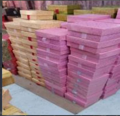
Rigid Gift Boxes